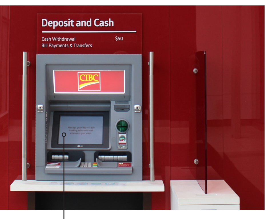
Bank Machine Film

Protection from acid, scratches, permanent marker and hard water stains