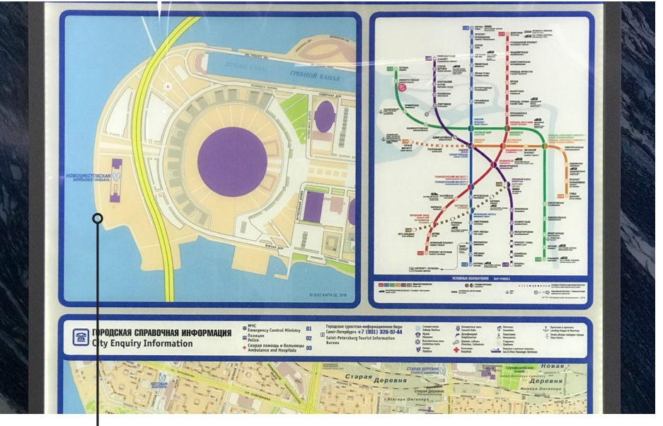
Metro Map & Directional Protection