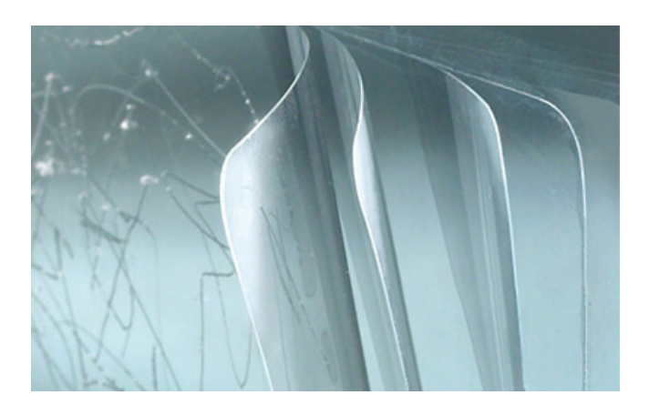
FOUR LAYERS OF PROTECTION