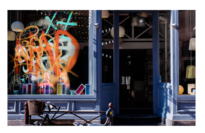
PROTECTION FROM GRAFITTI